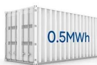
Standard 20ft containers

Should you require customized, wish to inquire about pricing, or seek additional information, we invite you to get in touch with us. Photovoltaic flexible bracket design allows the photovoltaic system to ...